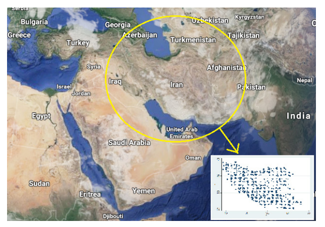
Figure 1. Geographical situation of Iran on earth.

Contour plot was used to graph the ecological map using Stata 14 software (StataCorp LLC, USA). Investigation of not studied places was performed using Shepard interpretation model. This model is used for estimation the depth of missing places in figures which have been previously used in medical imaging such as mammography (13). Estimated area (percentage) of vitamin D deficiency according to different cutoff points was through color