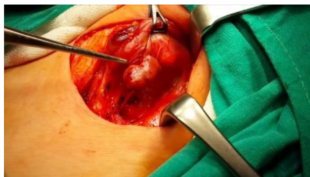
Figure 1. The glistening, encapsulated, and lobulated gross appearance of a solitary parathyroid adenoma during classical bilaterally neck exploration.